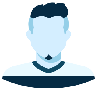
KIERAN DANIELS - DEF/MID

Dynamic player with a great left foot, can play in multiple positions and provides good options at the back or in midfield.