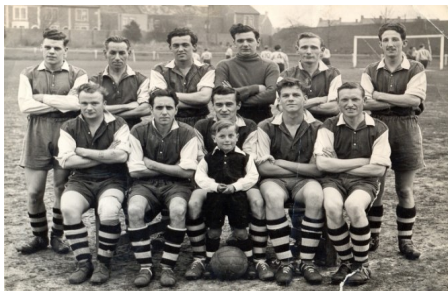
1957 CUP WINNING TEAM